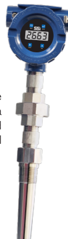
Temperature Assembly with a Digital Display and Thermowell