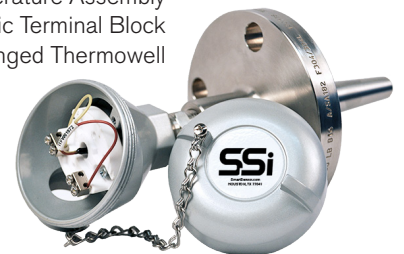
Temperature Assembly with a Ceramic Terminal Block and Flanged Thermowell