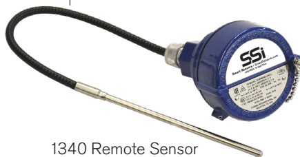
1340 Remote Sensor Assembly