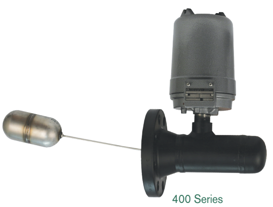
Side Mounted Level Switch