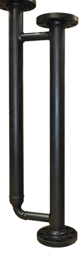
1000 Series Engineered Bypass Chamber